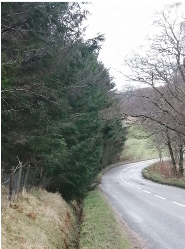
The modern (turnpike) road approaching Lumphanan with Stothill forest and the new access location on the left.

Fred suggested Highfield could make and use a parallel track for forestry vehicles to avoid the old track and extract the forest timber and fallen trees that way. He advised that heavy forest machinery prefers to operate over brushings of brushwood, preventing soil compaction. Fred also agreed to plot the old road on GPS as an exclusion zone, which will automatically alert machinery drivers if they get too close. Future planting would be set further away from the old road to help protect the route in the future.