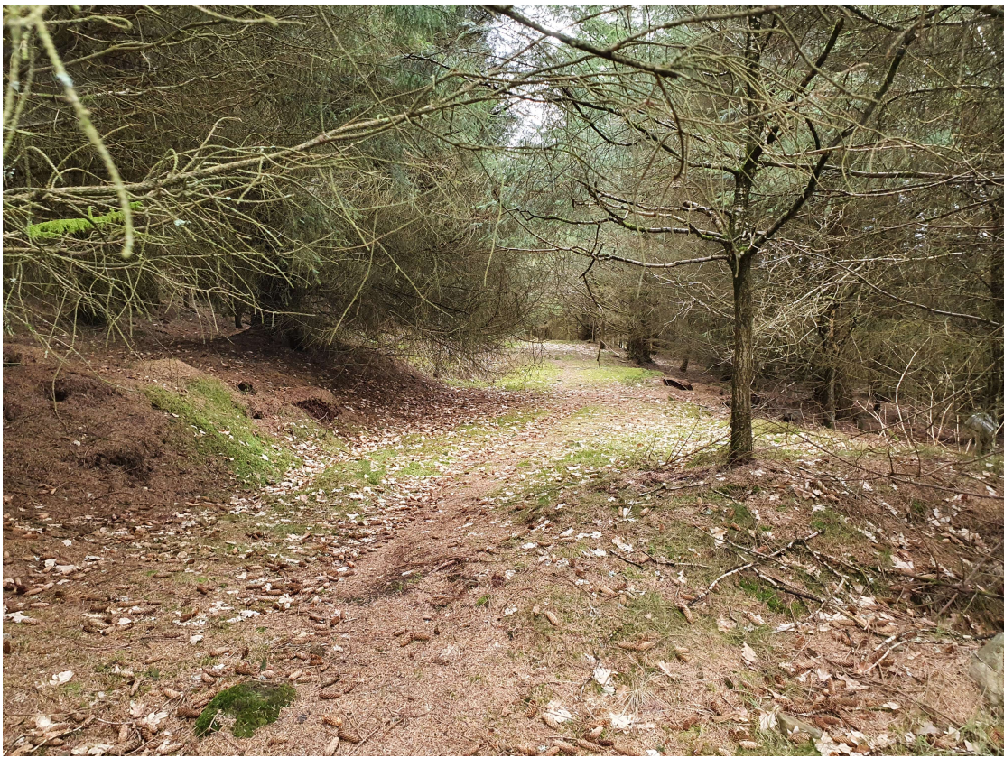
A view of the historic road to Lumphanan, pre-dating the current turnpike road (A980). Now a grassy track in this section through the lower forest at Stothill.